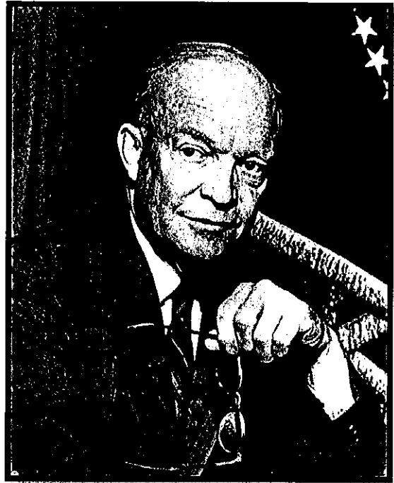
Dwight D. Eisenhower, half-length portrait, facing slightly right, holding glasses

Finally, you have broader considerations that might follow what you would call the "falling domino" principle. You have a row of dominoes set up, you knock over the first one, and what will happen to the last one is the certainty that it will go over very quickly. So you could have a beginning of a disintegration that would have the most profound influences.