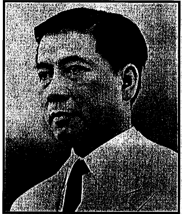
Resident DIEM Small Poster, 11/25/1954.

Editor's Note: The 1954 Geneva Accords, the peace treaty ending French colonialism in Southeast Asia, divided Vietnam between North and South. Reunification would depend on the outcome of a presidential election to be held in 1956. However, realizing Ho Chi Minh's popularity, the United States and President Ngo Dinh Diem, the leader of South Vietnam, refused to hold the elections. In this letter addressed to President John F. Kennedy, President Diem thanks and seeks additional support from the United States.