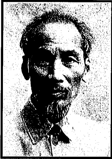
Ho Chi Minh, 1946. Cropped version

Editor's Note: On September 2, 1945, Ho Chi Minh delivered the Declaration of Independence of Vietnam in Hanoi. An excerpt follows: